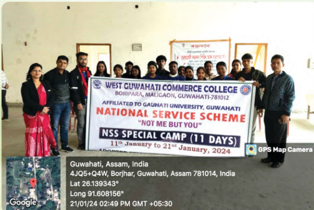
NSS Special Camp