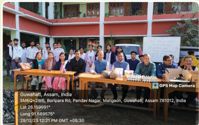
Magh Bihu Celebration