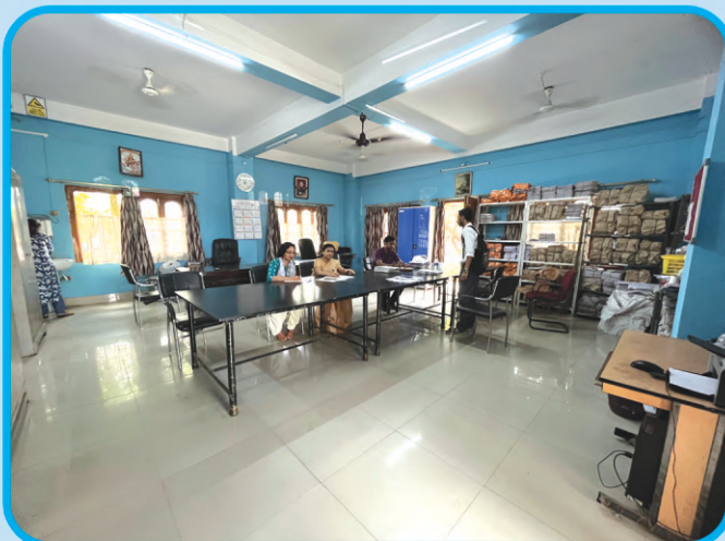
Exam Control Hall