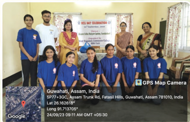
NSS Day Celebration