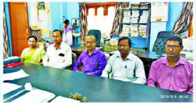
Exam Control Deptt.