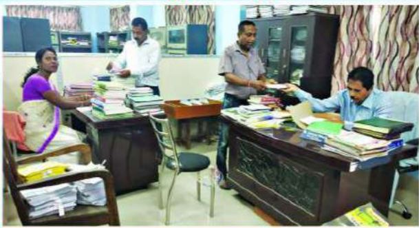
College Library Staff