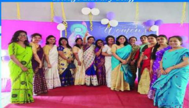
International Women's Day

PRAGATI GRAPHICS, Barabazar, Pandu, Ghy-12